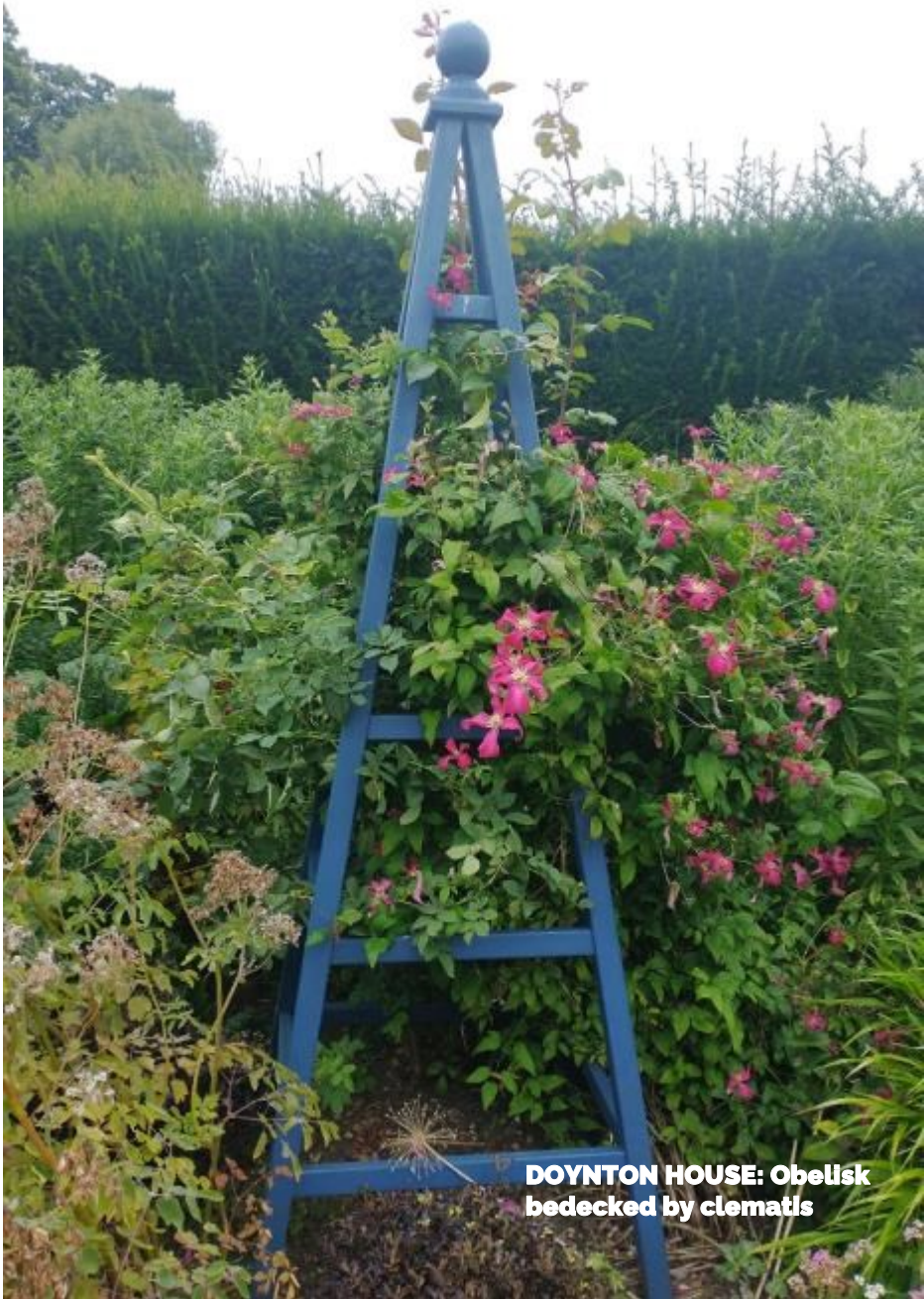
DOYNTON HOUSE: Obelisk bedecked by clematis